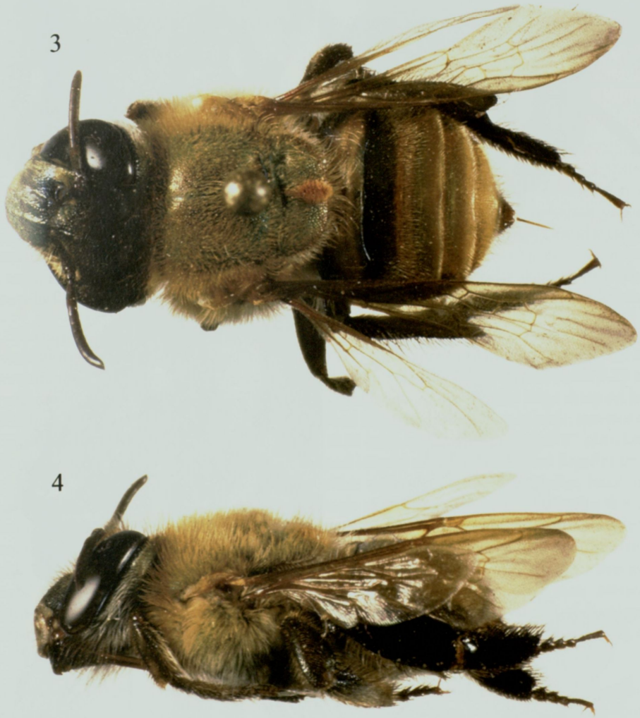
Figs 3-4: Euglossa (Euglossella) cosmodora sp. n., female paratype. – 3 dorsal habitus. – 4 lateral habitus (right side of bee photographed and then reversed in order to place anterior of bee at left of photograph).

termed catharotrichia (“cleaning hairs”) by MOURE & SCHLINDWEIN, 2002; however, the function of these setae is not well known so we have not employed this term]; metatibia with longer setae on anterior border and distal half of dorso-posterior border, outer surface with scattered, brown, short, erect setae, bare on contiguous depression to metatibial organ; metatibial organ slit closed with dark brown setae (Fig. 7). Metasoma covered with golden-fulvous, simple setae, moderately dense, long and erect on sterna, and antero-lateral corners and anterior border of first metasomal tergum; second through fifth metasomal terga with posterior bands of dense, golden-fulvous, appressed setae (Fig. 1); scattered, dark brown, short, erect setae on sides of second through sixth metasomal terga; false slits of second metasomal sternum with patches of dense, fulvous, long setae, directed posteriorly reaching posterior edge of sternum.