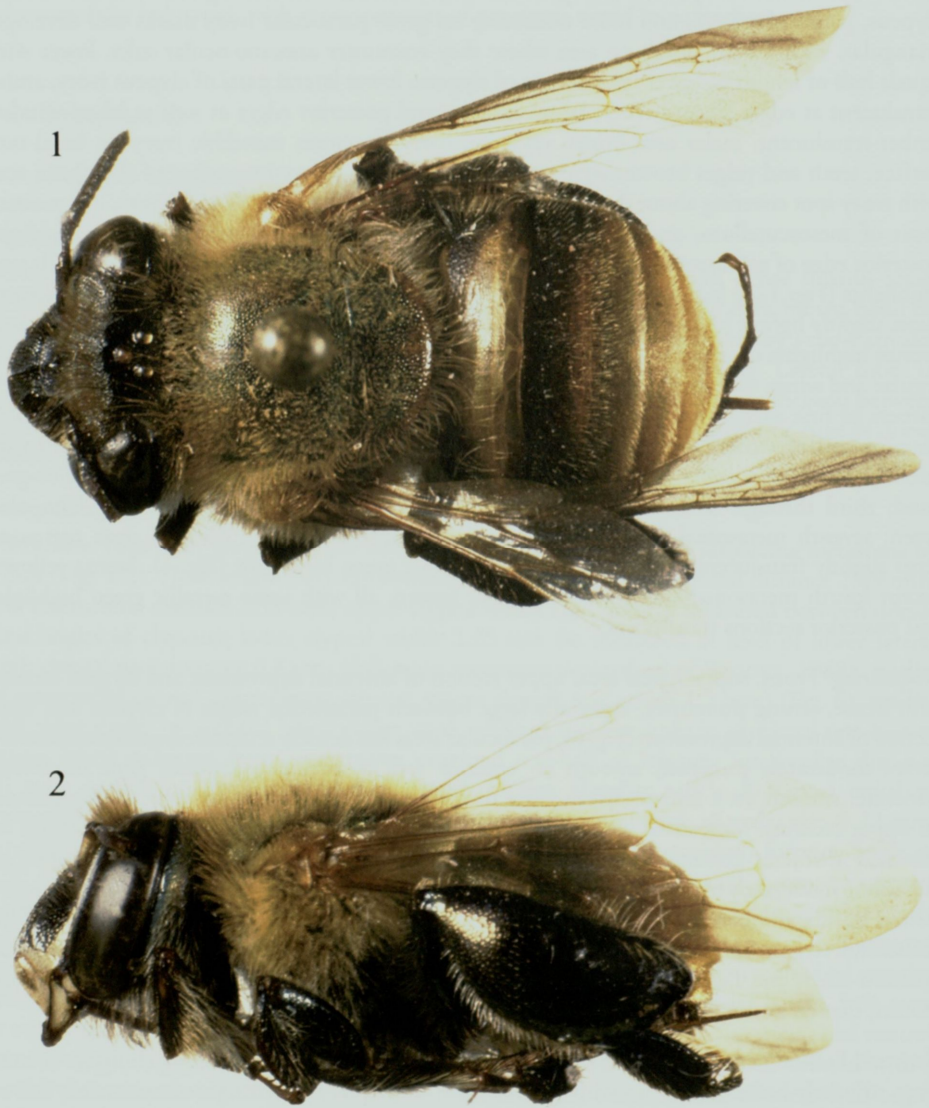
Figs 1-2: Euglossa (Euglossella) cosmodora sp. n., male holotype. – 1 dorsal habitus. – 2 lateral habitus.

ventral part of mesosoma (Figs 1-2); fulvous, simple, setae on femora (except as previously noted), tibiae (exceptions noted hereafter), and outer surface of tarsal articles; chemical gathering tufts on second through fourth protarsomeres made of dense, brown, long, setae; inner surfaces of probasitarsus, meso- and metatarsomeres with dense, dark brown, sturdy setae; mesotibia with two proximal tufts, anterior tuft rhomboid, about one-third as long as velvety area, posterior tuft oblong, about one-third as long as major axis of anterior tuft, both tufts made of fulvous setae directed posteriad; mesobasitarsus with three major wavy setae and two secondary setae (half as thick as the major setae) on inner surface right after proximal keel, all brown [these setae were