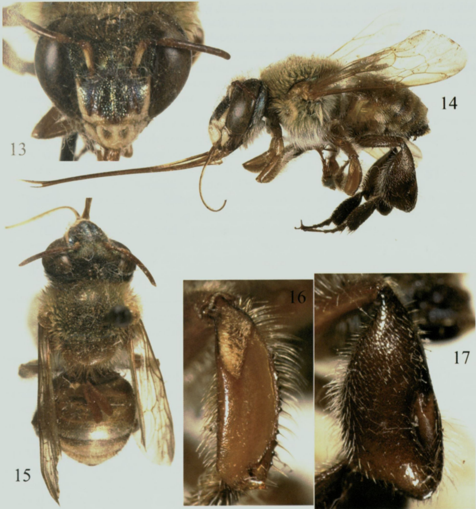
Figs 13-17: Euglossa (Euglossella) urarina sp. n., male holotype. – 13 facial aspect. – 14 lateral habitus. – 15 dorsal habitus. – 16 outer surface of mesotibia. – 17 outer surface of metatibia.

Coloration. Head mainly metallic dark green (except as described below), with bronzy-golden highlights specially on interantennal area and antennal depressions; clypeal ridges and edges brown, brown on anterior half of vertex and narrow genal streak bordering compound eye; paraocular ivory marks as in E. cosmodora , except lower width equals three quarters of length of lower lateral parts of clypeus; lower lateral parts of clypeus, labrum, malar area and mandibles as in E. cosmodora ; antenna brown; scape with ivory spot covering most of anterior surface (Fig. 13). Most of mesosoma metallic green with strong bronzy highlights (particularly on center of mesoscutum); anterior half of prothorax and anterior flattened sections of mesepisternum brown; posterior two thirds of mesoscutellum amber (Figs 14-15); legs brown, yellow-amber on two proximal podites; pretarsal claws slightly lighter, distal half dark brown; faint bronzy-green highlights on all legs specially on proximal podites (Figs 14, 16-17). First metasomal tergum amber-yellow mesally, lateral edges and posterior narrow streak brown; second metasomal tergum