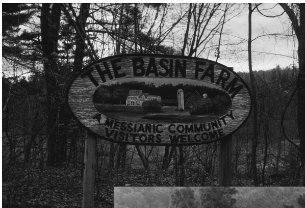
Photo 2. Basin Farm, One of the Messianic Communities/ Twelve Tribes

The story here is not one of a community that suffered an early death, or succumbed to internal squabbles, or was dismembered by external opposition, or “matured” into a less controversial movement than it had been in its earlier days. At this point in the history of the Twelve Tribes, the movement seems to be pretty much what it set out to be. Change may be inevitable, but one of the few notable changes in the Twelve Tribes is unusually strong growth. 5