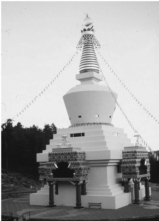
Photo 7. The Great Stupa at Rocky Mountain Shambhala Center

Despite years of legal and physical obstacles, Ananda has not only survived but has prospered. 18