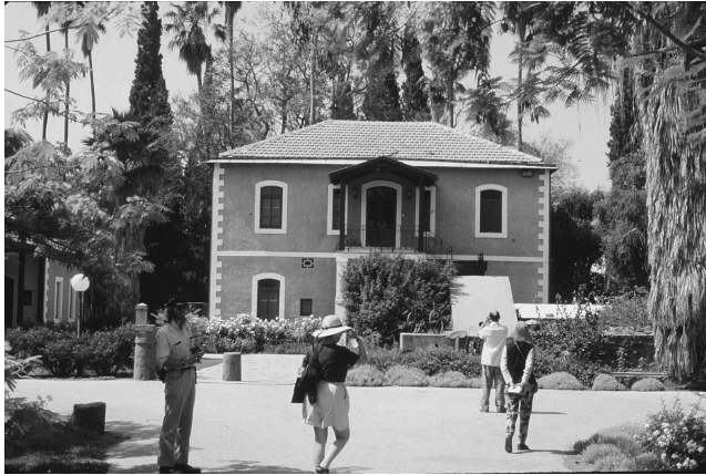
Photo 1. Degania, Israel's First Kibbutz