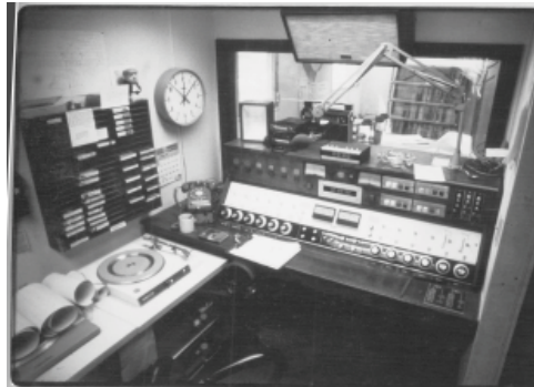
Left: Before Audio-Reader went digital, volunteers recorded onto reel-to-reel machines. Right: the trailer’s live broadcast studio.

“We went through a spell where we were re-using the reels, and they were very scratchy and it wasn’t much fun.”