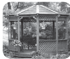
The gazebo in the Audio-Reader Sensory Garden.

"She was instrumental in creating the Trinity Foster Home, a group home for children. I also knew her for her role in improving