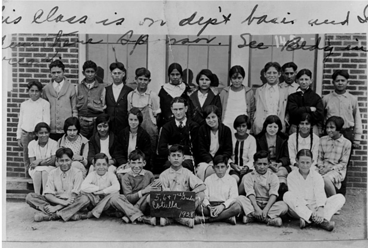
Lyndon B. Johnson with his students at the Welhausen School. 194