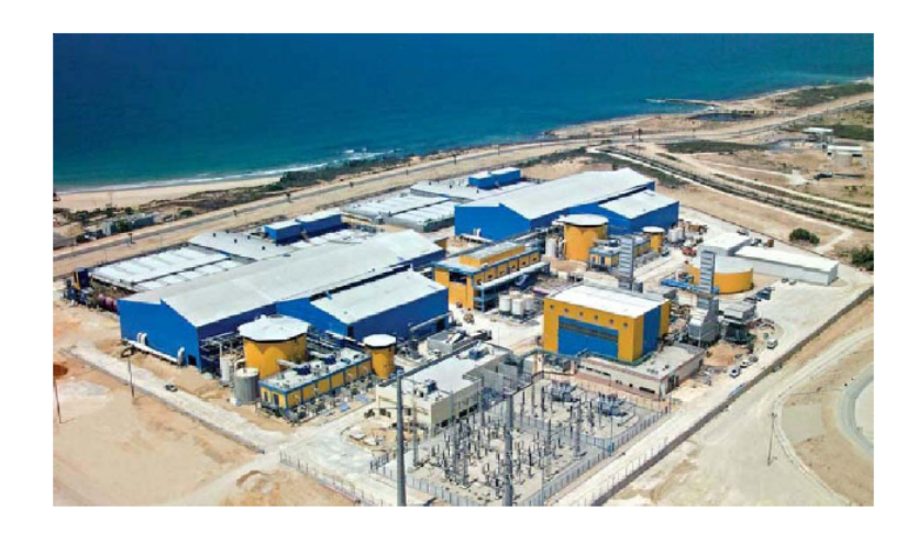
Figure 1 General View of Ashkelon Desalination Plant (Sauvet-Goichon, 2006).