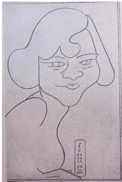
Fig. 2. Drawing of Aura Rostand. Accompanying title and text: “Siluetas de Zavala Urtecho. La pluma del delineador y humorista granadino Joaquín Zavala Urtecho hizo con estas pocas rayas la representación de Aura Rostand, la poetisa nicaragüense, ahora ausente del país.” El Gráfico V.200 (15 jun 1930): 7.