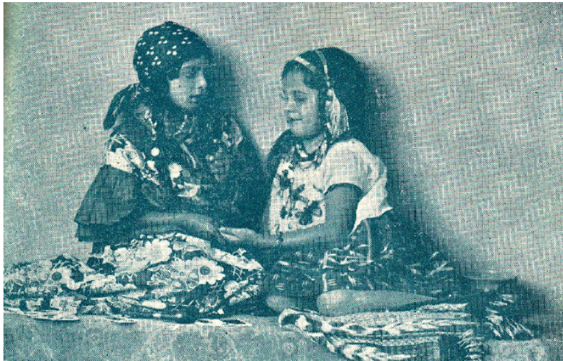
Fig. 2. Las nenas, photographic illustration from Olivia de Wyld, Pinceladas (Guatemala: Unión Tipográfica, 1934): 63.

among the Guatemalan elite, whose photographs regularly adorned the pages of national periodicals. 20