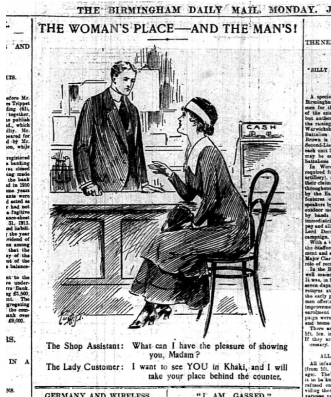
Figure 1: "The Woman's Place—And The Man's!" The Birmingham Daily Mail , July 26, 1915.

In 1914, Colonel Evelina Haverfield and the Women's Social and Political Union founded the Women's Emergency Corps (WEC), 10 which evolved into the Women's Volunteer Reserve (WVR) by 1915. 11 The creation of the WVR, Colonel Haverfield said, was to organize and protect women should there be an invasion of Britain. This meant that if the warfront would expand onto British soil, women would have an organization they could rely on to work with and for them when it came to protection of women and those who were more vulnerable in society. However, in order to justify the military organization of women, Krisztina Roberts explains the WVR's powerful use and description of the warfront, which established men's duties as being on the front lines in Europe and women's as a protectorate for the helpless on the home front, made