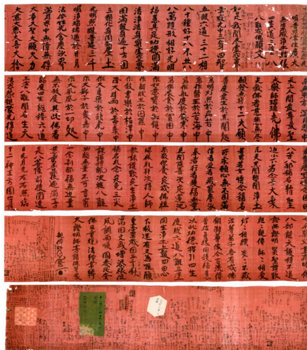
Figure 3. Prayer text by the monk Paegun and inscriptions of 1079 individual names, ink on red-dyed silk. Dated 1346, Koryŏ period (918–1392). L 1058 cm (417 inches), W 47.8 cm (18.8 inches). Originally stored inside the Medicine Buddha statue of Changgoksa, Ch’ŏngyang, Ch’ungch’ŏng Province.

and were written by one individual who wrote all the names of the respective group, while thirty percent are single names. Some individuals had an aristocratic background since they bear surnames, including 266 low ranking government officials and military officials; 22 local scholars, and 70 women with aristocratic status, among them 29 women with kunbuin 郡夫人 (lit. “wife of a lord”) titles, attesting to the wide social range of donors to this project. 17 Four separate pieces of exquisite fabric and silk brocade had been sewn onto the last portion of the piece. All four texts were written by aristocratic women of distinguished kunbuin status who wrote individual prayers to the Medicine Buddha, such as the wish to be reborn as a man and wishing a two-year-old child a long life (Jeong and Shin 2017, p. 191). These individuals likely donated to the project significantly more than others, and were therefore provided with the privilege to submit their own personal prayer texts. Alternatively, the social etiquette of the time might have made it difficult for elite women to see Buddhist male monks directly; hence, these textile pieces likely functioned as a bodily medium that substituted for the elite women’s direct participation in signing the text.