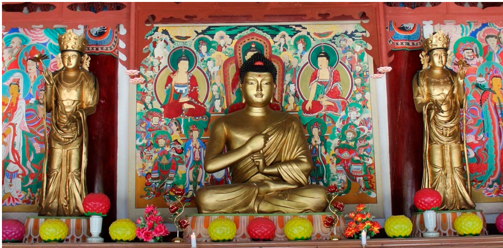
Figure 1. Vairocana Buddha with attending bodhisattvas, gold and colors on wood. Latter half of the twentieth century, Pohyōnsa, Myohyangsan, North Korea.

items that piled up like mountains.” Through these donations, the Pohyōnsa monks were able to commission clay sculptures of Vairocana Buddha (K. Pirojanabul 毘盧遮那佛) and two attending bodhisattvas, Mañjuśrī (K. Munsubosal 文殊菩薩) and Samantabhadra (K. Pohyōnbosal 普賢菩薩), decorated with gold, silver, and precious jewels (today, modern versions of these sculptures are enshrined in the main hall of the monastery, Figure 1). In addition, Hakchu used the remaining funding to commission ritual instruments, such as a bronze bell, a metal chime, an incense burner, and ceramic jars. 6