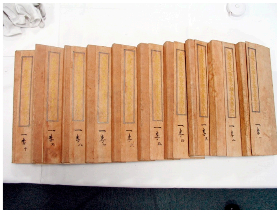
Figure 5. Sūtra on the Great Perfection of Wisdom (Taebanya paramilta kyōng 大般若波羅蜜多經), volumes printed from woodblock in ink on paper, part of the Sillŭksa Canon. Dated 1382, Koryŏ period (918–1392). L 49–53 cm (19.3–20.8 inches), W 28 cm (11 inches). Collection of Otani University, Kyoto.