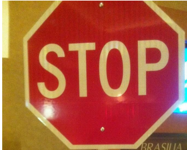
Figure 17.5: Example of Stop Sign made from recycled printer cartridges

of electronics and the capturing of value from items going backward is a critical aspect of success in the realm of reverse logistics. Figure 17.5 shows an example of road signs being produced from recycled printer cartridges. These signs are more durable than aluminum signs, cheaper than aluminum signs, and because they are not made of aluminum, they are not stolen as often.