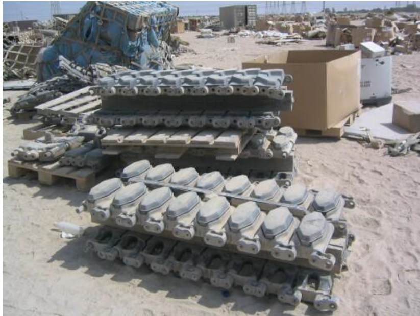
Figure 17.2: Items Waiting Return from Kuwait According to the General Accounting Office

filled with stuff waiting to be returned to the United States. Some of this can be seen in Figures 17.2 and 17.3 from the GAO report.