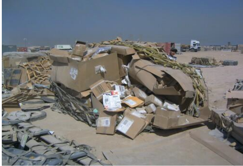
Figure 17.3: Items Waiting Return from Kuwait According to the General Accounting Office 108

For every item ordered that was not really needed or that for whatever reason did not reach its intended customer, the reverse logistics problem grew. As the US Armed Forces started the withdrawal from Iraq and Kuwait, perhaps the largest reverse logistics operation in history occurred.