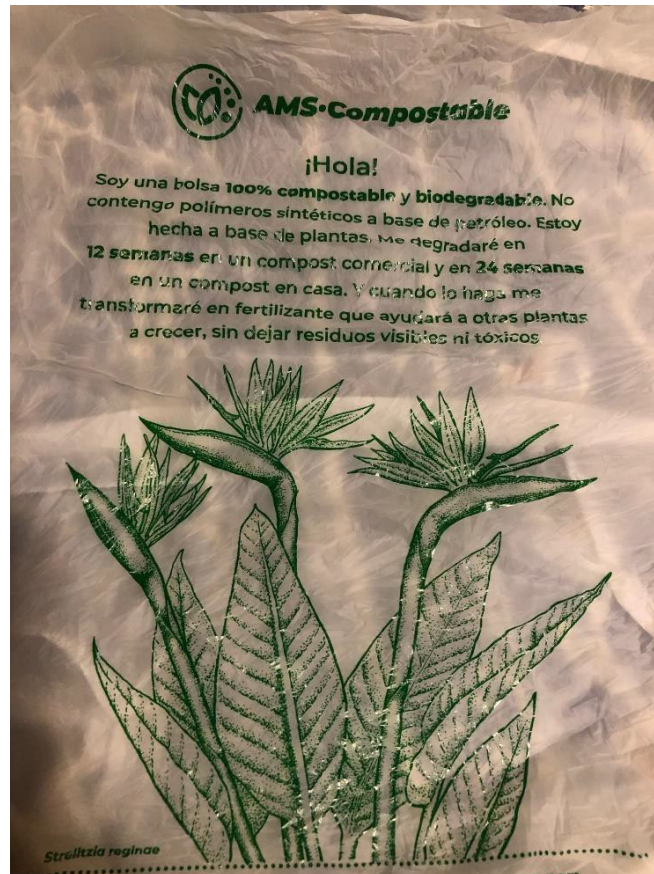
Figure 12.8 Compostable Bag

12.8 is an example from Panama of a grocery bag that is designed to compost. Even recycling of bags is not new as grocery bags were recyclable in Germany in the early 1990s.