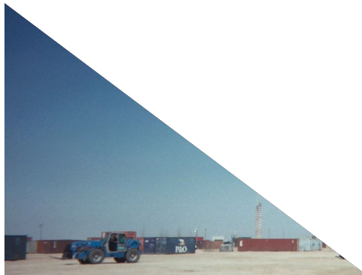
Figure 12.5: Example of Commercial Variable Reach Forklifts in Action in Kuwait, April 2003

This forklift was ready for manufacture and issue to the units in the field. This was going to be the Rolls-Royce of forklifts. It was hardened against chemical attacks, nuclear attacks, and it had an enclosed cab with air conditioning and heat.