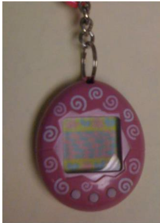
Figure 12.1: The Giga Pet

product, demand for the product will decline and may even stop. This must be considered as part of the product design process. The Giga Pet in Figure 12.1 is a good example of a short life cycle (The Giga Pet was the first virtual pet). The fidget spinners from a few years ago is another example of a short life cycle.