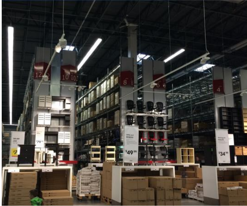
Figure 12.9 Ikea Distribution Area