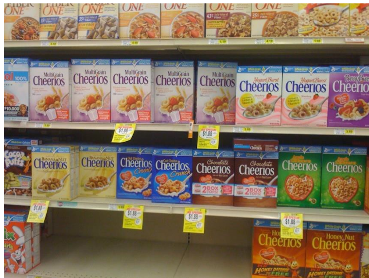
Figure 12.3: Options for Cheerios