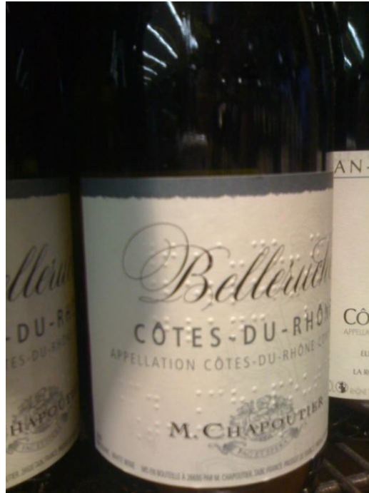
Figure 12.6: Braille Label

While the product design is ongoing, the process design must be ongoing as well. These are related events. If the two are not conducted concurrently the company may find that they have a great product and a good prototype but do not possess the ability to produce more than one of the items.