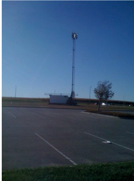
Figure 10.1: Sprint Mobile Communications Tower at a Kansas Speedway NASCAR Event

for NASCAR’s top racing series, Sprint (Sprint is now a part of T-Mobile) provided towers to help with the additional coverage needs at the events. 66 These mobile towers disappeared after Sprint was no longer the sponsor for NASCAR’s top series.