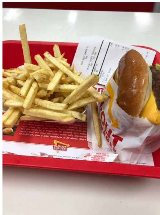
Figure 10.2a: In-n-out

Another example of consistency and accuracy of service is In-N-Out Burger® on the West Coast. This restaurant has a cult following that goes back to the beginning of the company in the 1940s. In-N-Out makes each order as the order is taken. The burgers are made from daily ground beef and daily cut potatoes for the French fries. Each order is then checked before giving it to the customer. Figure 10.2a shows the fresh French Fries and 10.2b shows the operations in an In-n-out restaurant.