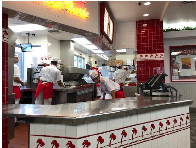
Figure 10.2b: In-n-out Restaurant

Consistency as service quality dimension also includes—does every customer get treated the same? However, there are exceptions to this dimension. In Las Vegas, the gambler willing to lose lots of money will get better treatment than those willing to lose $20-30 dollars. Is this an aberration to the consistency dimension? Not really. When the Superbowl was hosted in Phoenix in the mid-1990s, the management of the Las Vegas Casinos stratified their customer base and identified over 20 gamblers capable of losing over $2 million in a weekend, another 50 or so willing to lose about a million dollars in a weekend and several hundred capable of losing over $500,000 in the course of the weekend. The casino operators targeted those gamblers and flew them to the game on a private plane, paid for their tickets, and brought them back to Las Vegas. The rationale was that if the gamblers were going to lose that much money, the operators wanted the gamblers to lose the money in their casinos. These gamblers got “comps” in rooms, tickets, meals, and airfare. I got a few free drinks. Was this consistent? Yes, if the casinos are going to stay in business, they have to cater to the folks