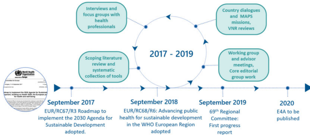
Figure 2 Timeline of the development of the E4A approach (World Health Organization Regional Office for Europe, 2019)

Development Group’s SDG Acceleration Toolkit and the UN Development Programme’s library was conducted, which returned ~800 tools. Two sets of criteria were then established for inclusion: (i) tools that were published in the last 5 years and (ii) tools that were deemed practical, useful for decision-making across different areas of health, supportive of actions and interventions to achieve SDGs and targets and that had the potential to accelerate implementation across the SDGs and targets. This resulted in a list of 400 tools, categorized by four WHO experts into (i) SDGs and target(s), (ii) the SDG Roadmap’s strategic directions and enablers and (iii) stages of the policy cycle. Classification conflicts were resolved through consensus judgments. Third, in preparation of the first progress report on the implementation of the SDG Roadmap in 2019, 3 two additional reviews were undertaken on (i) SDG governance arrangements and health content as described in 43 Voluntary National Reviews (VNRs) conducted by WHO European Member States and (ii) the extent to which the actions taken in 20 countries, as described in their VNRs, align with the Roadmap’s recommendations. 15 Fourth, an analysis on the status of each of the SDG 3 targets and on several other health-related SDG targets, their interconnectivity with other SDGs, available policy instruments, indicators and resources was conducted. 16,17