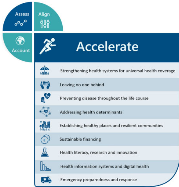
Figure 4 The proposed accelerators, partially derived from the SDG Roadmap (World Health Organization Regional Office for Europe, 2019)

Continuous and sustained efforts at alignment, often supported by policy dialogs within and beyond the health sector, promote policy coherence in implementation 35 and require institutional capacity and evidence-based knowledge. Important aspects, like health equity, gender and human rights, accountability and the outlook of young and future generations are important elements of alignment. 6 Alignment has been recognized as critical to advancing health through a number of global legally binding instruments and UN resolutions or common positions, including for example the global implementation of the Framework Convention on Tobacco Control, 36 the International Health Regulations and agreements on both communicable diseases and NCDs, most recently through the UN Common Position on Ending HIV, TB and Viral Hepatitis. 37