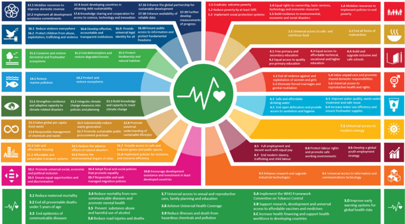
Figure 1 Health-related SDG targets (World Health Organization Regional Office for Europe, 2019)

immunization rates, tackling risk factors like obesity, alcohol, tobacco use and air pollution, addressing mental health disorders and reducing interpersonal violence. 3