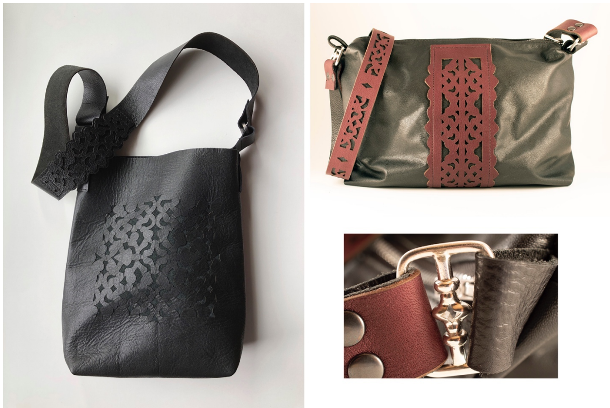
Figure 3: Bandolier Bag #1(left) & #2(right)

I have always been attracted to bandolier bags for the same reasons I was attracted to moccasins. Even before reading about them in books it was explained to me by my grandmother and mother that the bags were never used to hold anything. The bags were merely for show. The bags served to show off the fact that someone thought so highly of you as to painstakingly bead an endless number of tiny beads. An entire bag with beautiful one-of-a-kind designs that represent you.