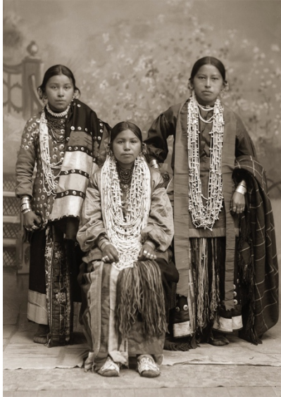
Figure 5: Wisconsin Historical Society

The various accessories such cuffs (Figure 4 top), earrings (not pictured) and rings (Figure 4 bottom) serve as modern adaptations of the accessories worn historically by Ho-Chunk and Potawatomi women of the past (Figure 5). With the innovation of 3D CAD software, intricate and symmetrically precise Woodland designs are possible on something as small as a ring. My goal in featuring the design in this manner was from the simple fact that I have never seen Woodland designs from my region of the United States in fine jewelry form. There is the assumption that Native American jewelry has Southwest patterning and involves Turquoise stones. My work dares to contradict the assumption of what Native American jewelry is and what it looks like.