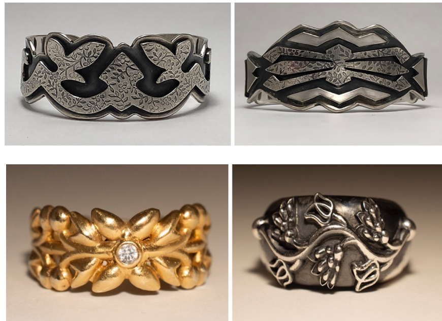
Figure 4: Cuffs (top) Rings (bottom)