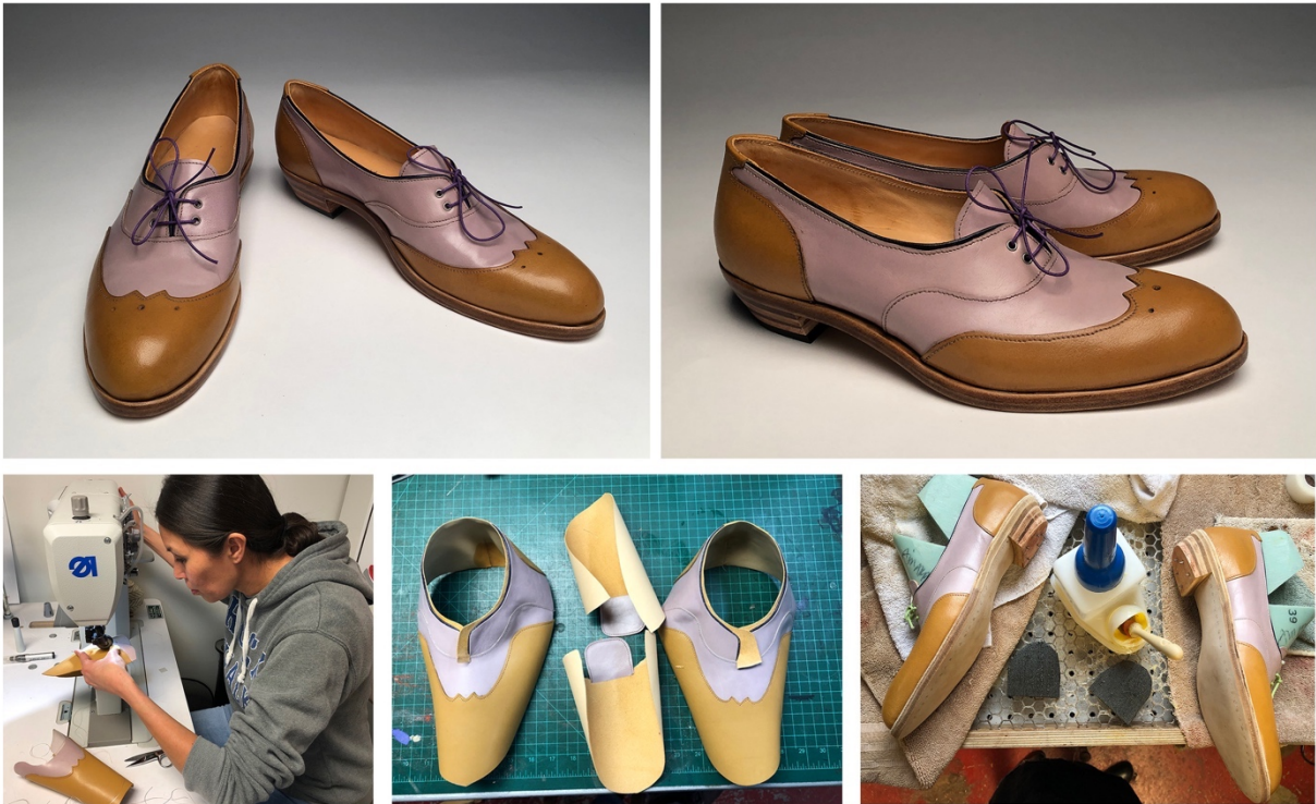
Figure 2: Mama's New Mocs