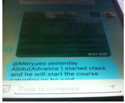
Fig.1. Viber Text 1

When the university undergraduate learners used Viber to convey the message, some of them attempted to be formal in their language use, as they used grammatically correct English language and well spelt words to communicate the message. Text message taken from the targeted students is given below to show their use of formal English language.