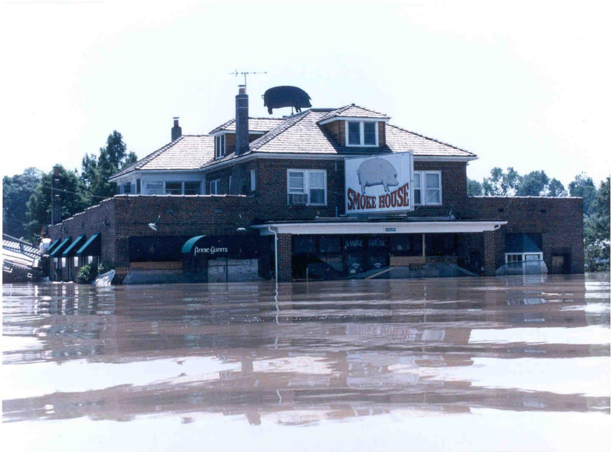
Figure 7: Annie Gunns Smokehouse