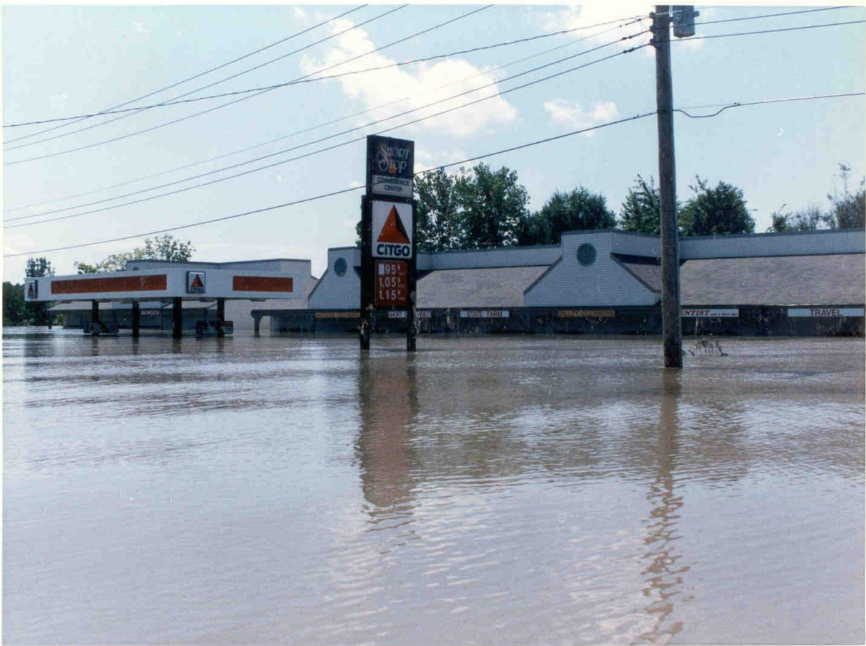
Figure 9: Supply and Demand Curve Example: The increase in land available accompanied by the decrease in demand for flood ridden land, significantly reduces the per acre cost.