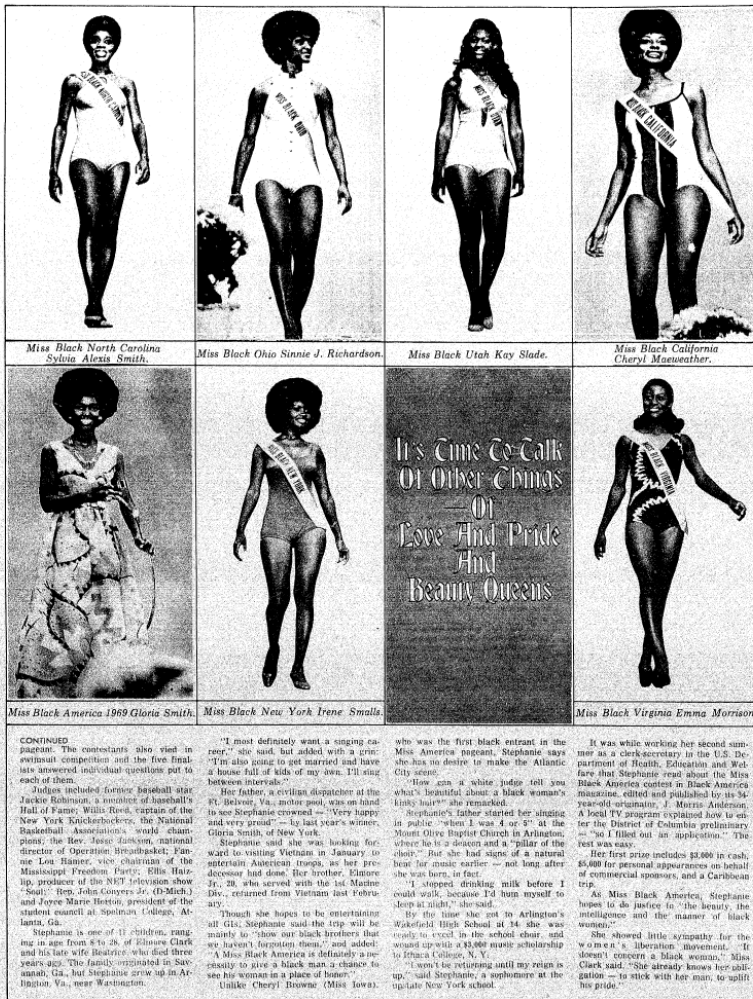
Figure 4: January 10 th 1971 Pacific Stars and Stripes spread. "It's Time to Talk of Other Things Of Love And Pride And Beauty Queens"

To be clear, these women were not just parading themselves around a stage in order to gain a title that simply complimented their body measurements or swimwear. To them, it was important that they express pride and to pave the way for future black women and black Americans who they believed deserved better civil rights. These women carried themselves across the stage with pride. They were speaking out against social injustice and pursuant of traditions that continued to encourage black pride. They were actively involved in the labor of supporting and advancing black