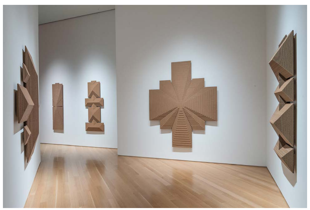
Installation view, "May Tveit: Universal Boxes." Left to right: Me and You , 2017, corrugated cardboard, glue, 66 \times 83 \times 5 in., The Well , 2017, corrugated cardboard, glue, 68 \times 19 \% \times 3 \% in., The Road , 2017, corrugated cardboard, glue, 68 \times 29 \% \times 4 in., Say Yes , 2017, corrugated cardboard, glue, 85 \times 68 \times 3 in., Purgatory , 2017, corrugated cardboard, glue, 68 \times 32 \% \times 7 in.