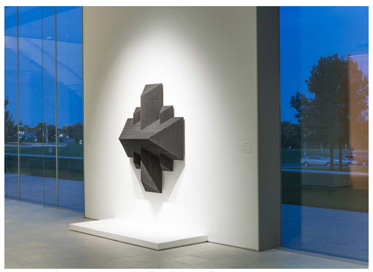
May Tveit, Look Up , 2017, corrugated cardboard, glue, graphite, 66 x 55 x 16 in.