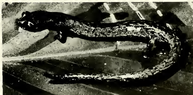
Fig. 1. Nototriton brodiei , paratype (UTA A-51490), adult female, 32.0 mm SL. Reproduced from UTA slide no. 20537.

Diagnosis. —A member of the Nototriton nasalis group (sensu Papenfuss and Wake, 1987) that can be distinguished from N. nasalis , N. veraepacis , N. sanctibarbarus , N. alvarezdeltoroi , N. adelos , and two species subsequently described in this paper by having small nares (Fig. 2A) that are about 0.004 of the SL (vs. 0.015–0.029 in the other species) and by having relatively shorter limbs (CCL/SL = 0.31–0.33 vs. 0.40–0.54). Most notably, females differ further from female N. nasalis having limbs that are separated by 5.5 (vs. 2.5–3.5) costal folds; from female N. veraepacis in attaining a larger size (maximum of 34.5 mm vs. 32.5 mm), having a proportionally smaller head (0.12 vs. 0.13–0.15 of SL), more premaxillary plus maxillary teeth (60–62 vs. 45–57), and more vomerine teeth (23–24 vs. 8–11); from N. sanctibarbarus in having a relatively longer tail (1.42–1.44 vs. 0.82–1.14 of SL), a smaller head (0.12 vs. 0.13–0.16 of SL), a smaller hind foot (HFW/SL = 0.06 vs. 0.08–0.12),