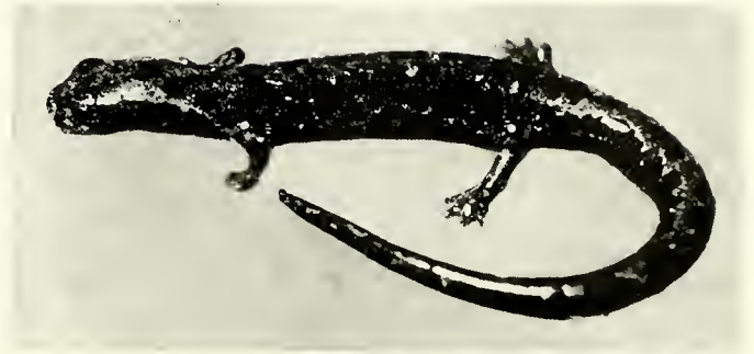
Fig. 3. Nototriton wakei , holotype (UTA A-50002), adult female, 26.8 mm SL.

Diagnosis. —A member of the Nototriton nasalis group (sensu Papenfuss and Wake, 1987) in which females may be distinguished from those of N. brodiei , N. lignicola , and N. barbouri by having large nares (Fig. 2B) that are about 0.022 of the SL (vs. 0.004–0.016 in those three species) and by having relatively longer limbs (CCL/SL = 0.44 vs. 0.30–0.34). The female holotype of N. wakei further differs from female N. brodiei in having a shorter tail (TL/SL = 1.18 vs. 1.42–1.44), wider head (HW/SL = 0.15 vs. 0.12), 2.5 (vs. 5.5