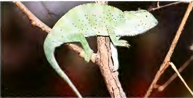
Fig. 12. Chameleo gracilis (NLU 70547) collected after falling from a tree in the village of Somoria.