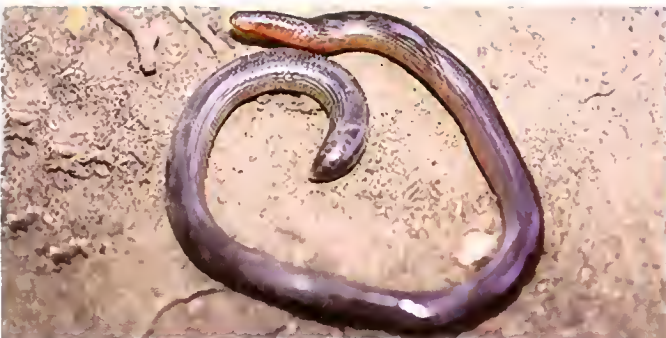
Fig. 16. Typhlops punctatus (NLU 70569) collected in a pitfall trap in gallery forest adjacent to Kofing River.