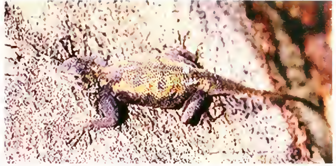
Fig. 11. Agama agama (CNSIB 108), adult female, collected on a tree trunk in the village of Somoria.