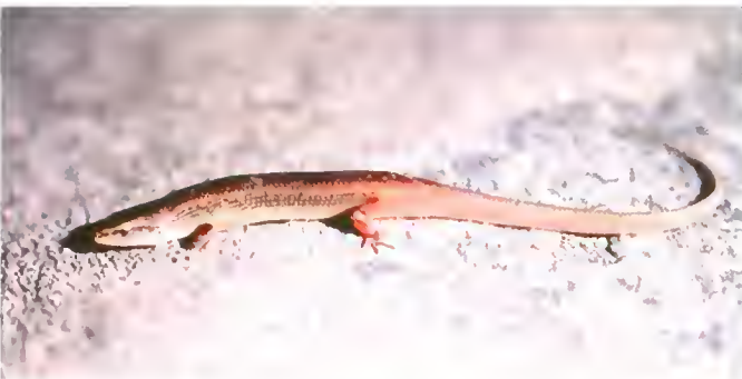
Fig. 14. Leptosiaphos togoensis (KU 291903) collected in leaf litter in gallery forest adjacent to Kofing River.