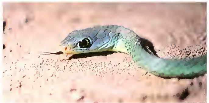
Fig. 17. Philothamnus heterodermus (NLU 70566) collected in funnel-trap in gallery forest adjacent to Kofing River.