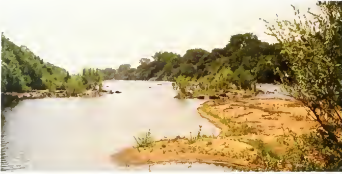
Fig. 2. Major pool in the Niger River looking downstream from the lower end of the run at Somoria.