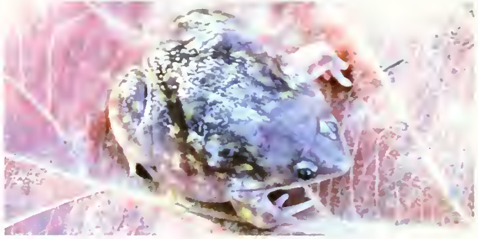
Fig. 5. Hemisus marmoratus (NLU 70622), adult female, collected on a dirt road at Diaragbèla.