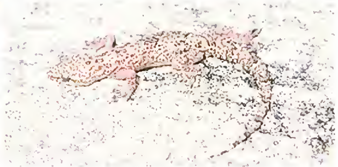
Fig. 13. Hemidactylus brookii (NLU 70536) collected on the wall of a hut at park headquarters.