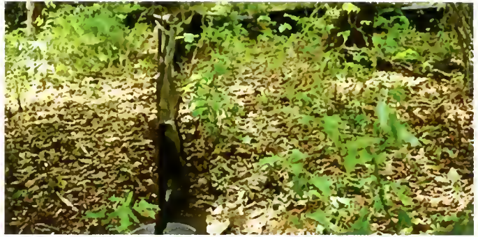
Fig. 3. Drift fence #1 placed in gallery forest of the Kofing River.