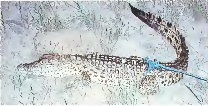
Fig. 10. Crocodylus suchus (KU CT 11915) photographed near Niger River at Mafou Bila.