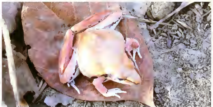
Fig. 9. Ptychoadena tellinii (NLU 70625), adult female, collected on the side of a road at Diaragbèla.