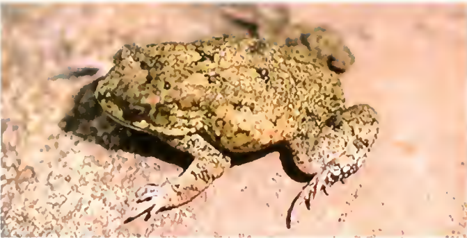
Fig. 4. Bufo maculatus (NLU 70572), adult male, collected as it was calling on the banks of the Niger River.