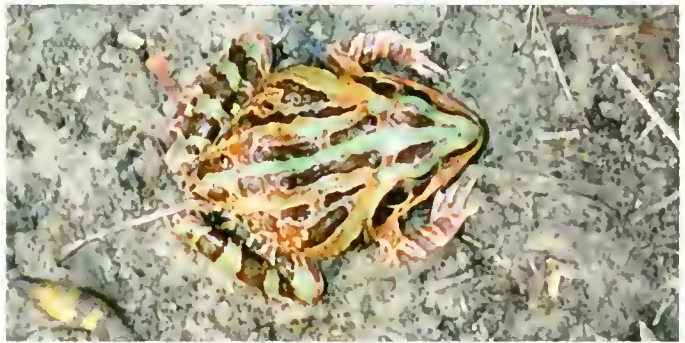
Fig. 7. Hildebrandtia ornata (NLU 70623), adult male, collected on a dirt road at Diaragbèla.