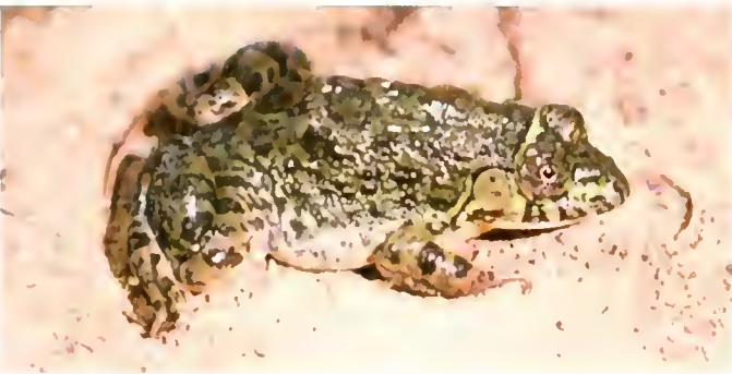
Fig. 8. Hoplobatrachus occipitalis (NLU 70545) collected in shallow pool of the Niger River, Somoria.