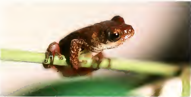
Fig. 6. Hyperolius mtidulus (KU 291900), subadult male, collected from damp leaf litter near park headquarters.