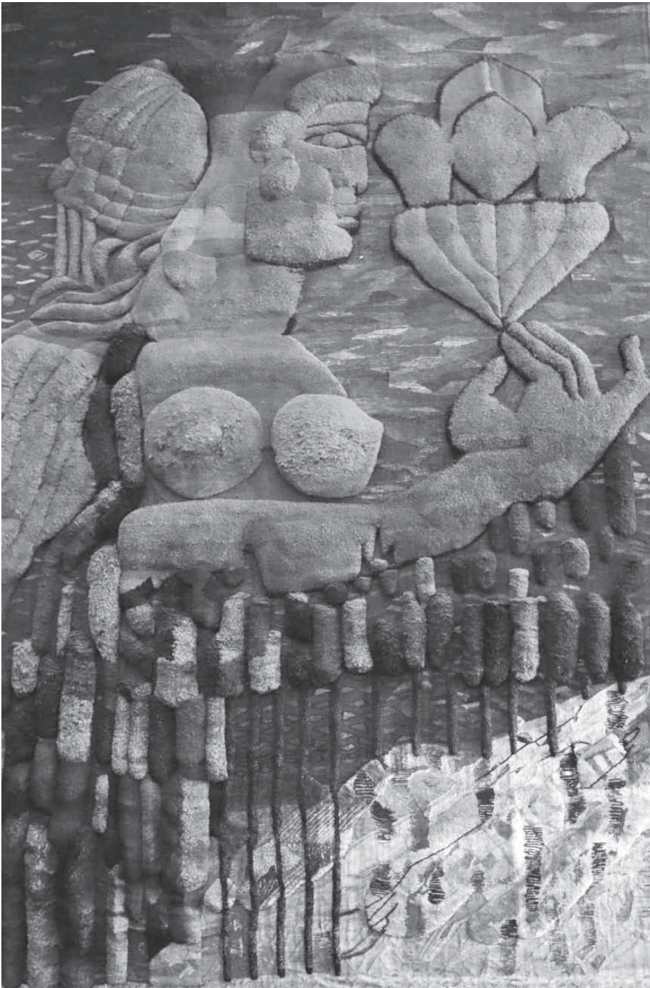
Safia Farhat. Untitled , 1978. Wool tapestry, 5.25 × 2.62 m. Collection of the Banque centrale de Tunisie.