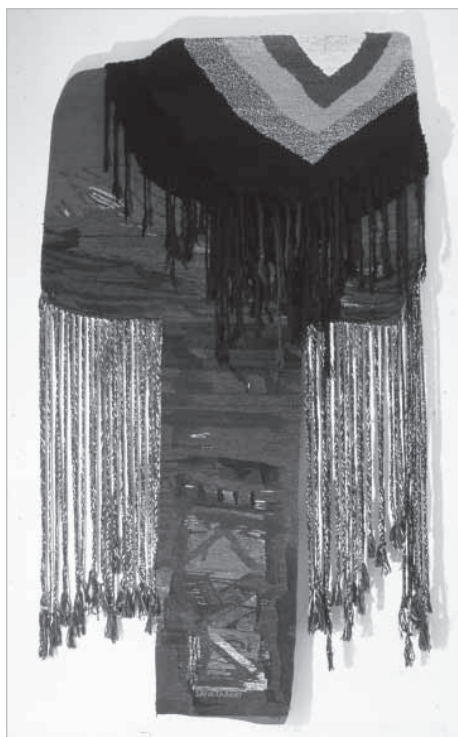
Safia Farhat. Le cyclope , 1972. Wool tapestry, 2.5 x 1.2 m. Collection of Aïcha Filali.

owned hotels, banks, factories, tourist bureaus, and government offices, the woven areas of Le couple are bedecked with loose, hanging, knotted cords. Rather than consisting of a singular plane, this tapestry comprises several autonomous pieces. The base is a rectangular woven structure with colorful geometric motifs, modeled on those historically produced by women weavers from the Gafsa region of southern Tunisia. A woven protrusion with a zigzag edge, made possible by the use of a discontinuous warp, is attached to the top of the base. The central point of the tapestry, void of any woven form, permits the viewer to see the wall behind a tangle of multicolored cords with tassels. These cords are threaded through the comb-like protrusion above and pulled through the empty space to drape alongside colorful representations of ropes woven into the flat base. Although intended for display against a wall, Le couple demonstrates Farhat's engagement with debates emanating from the Lausanne Biennial concerning the direction of fiber art. 59 Shortly after the work's production, Farhat submitted it for review for the Sixth Lausanne Biennial, held in 1973. 60