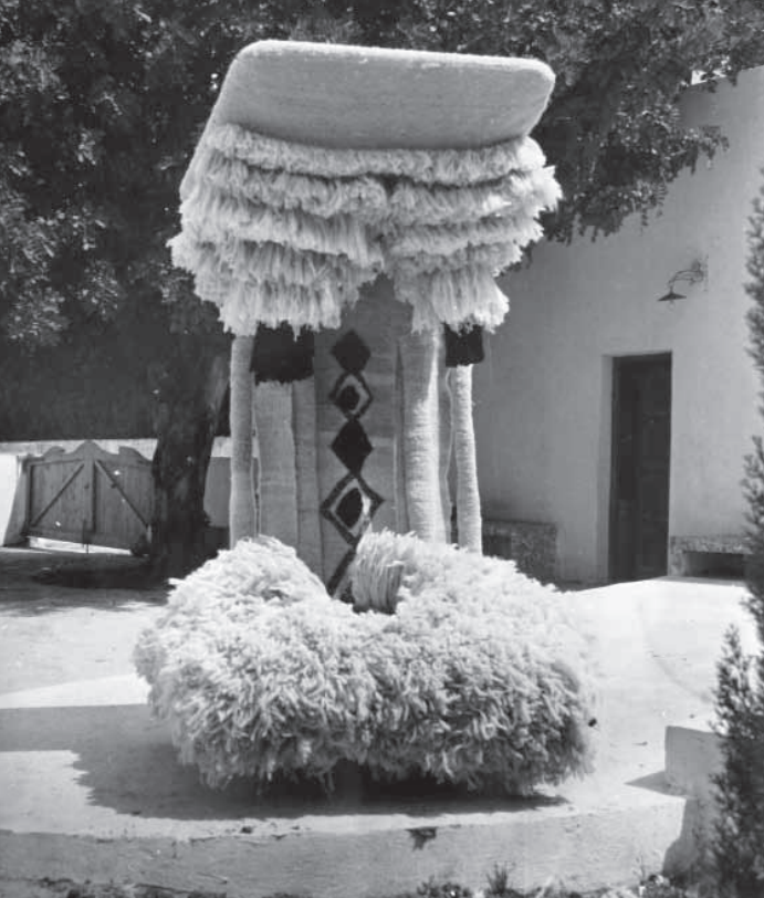
Safia Farhat, Fécondité , 1972. Wool tapestry, 0.8 x 0.6 x 1.5 m.

the Warsaw Academy. 63 She simultaneously drew from her own observations of Gafsiën weavers whose work was characterized by bold geometric and figurative motifs and coarse, handspun wools. 64 Farhat's integration of these designs and materials into fiber sculpture not only demonstrates her command of the visual grammar of the New Tapestry movement, but also verifies the intellectual networks she intersected.