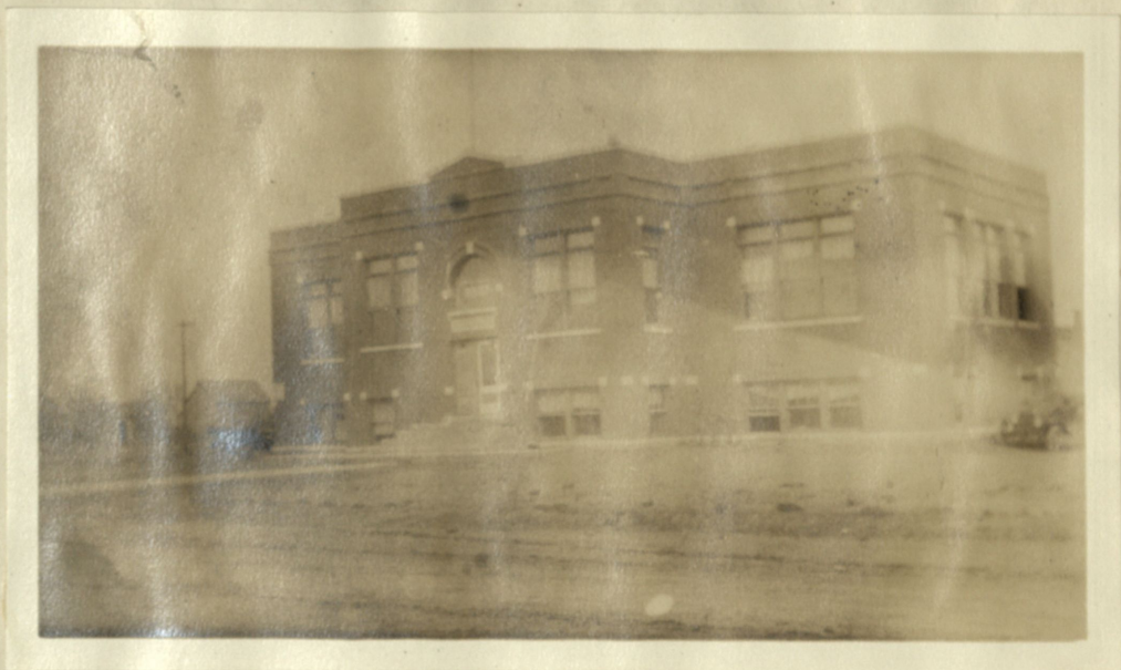
The Rural High School At Agenda Kansas.

The High School building is well suited to present needs but an addition will soon have to be made if the present rate of increase continues. It is a two-story building. On the second floor is the auditorium, two recitation rooms and three rooms used for laboratory purposes, besides the office, library and cloak-rooms. The assembly room is so situated that by rolling back the partitions separating them the two class-rooms, one on either side, may be thrown into one with the assembly