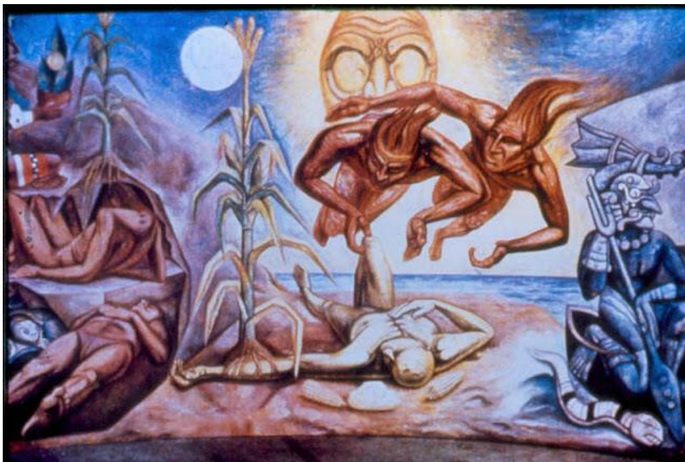
Figure 5: Raúl Anguiano, The Creation of Mankind in the Maya World, 1964