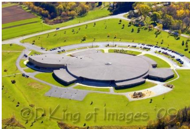
Figure 7: Helicopter view of Turtle School, Dennis King, 2009

actually shaped like a turtle (see Figure 7). This is intended to honor Mother Earth as she was created by Sky Woman on the back of a turtle in our creation story. Upon entering, the design of the school is a large circle signifying the belief of a never-ending cycle of life, with branches of classroom areas in the legs and tail. All along the hallway walls of the circle, tiles tell the creation story, with pictures depicting the events that took place. At the very center of the turtle is a large skylight that connects the lower world to Sky World, from where Sky Woman fell, as well as the home of the spiritual beings from which we came. Thus, the brightest spot in the whole building is its center. The classrooms that surround this central area are where language and culture lessons are taught so that the people remember that their culture is the center of the Hotinoshonni way of life.