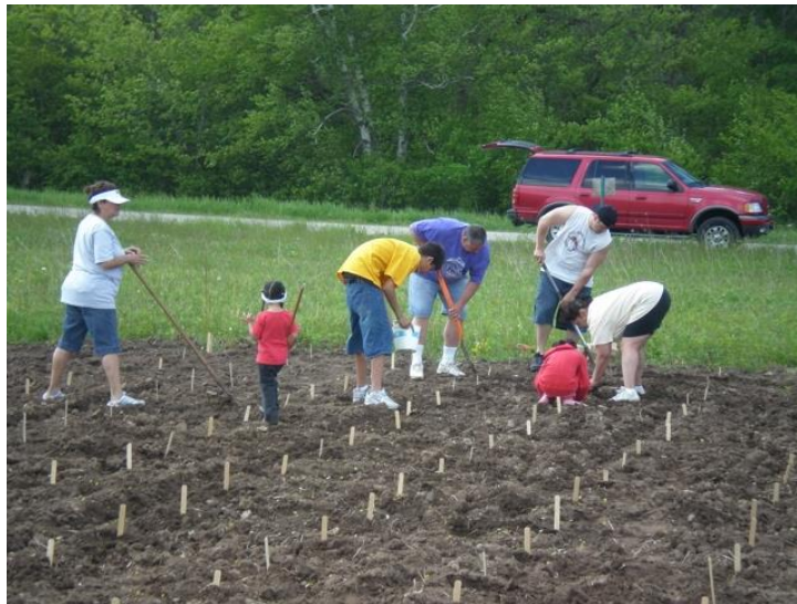
Figure 6: Tsyunhehkw^ planting season