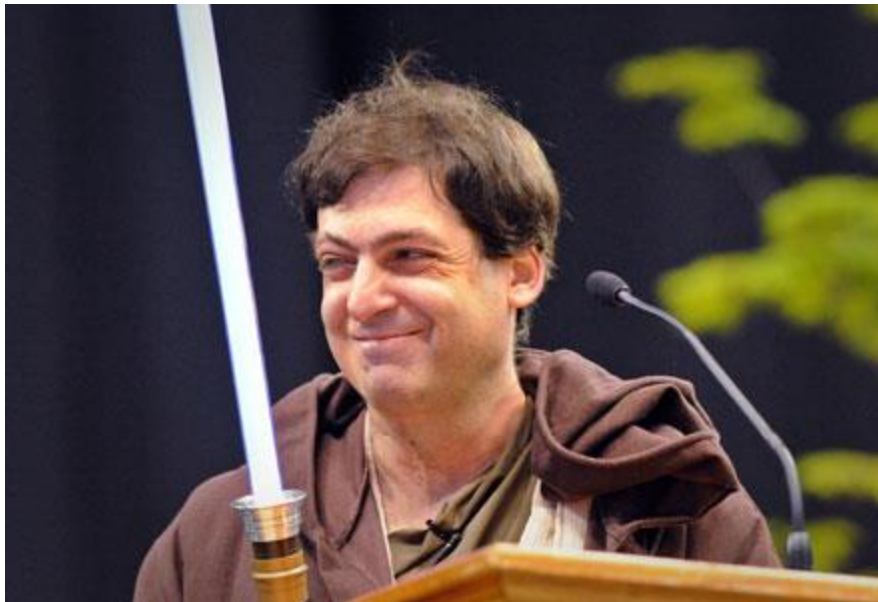
Figure 10: Dr. Ariely dressed as a Jedi at UNC

Dr. Dan Ariely, professor of Psychology and Behavioral Economics at Duke University, provided a general example during his keynote speech at UNC's 2013 Doctoral Hooding Ceremony (Ariely 2013; Figure 10). He asks the arena a question, "What would you rather have, a half of box of chocolate right now or a full box of chocolate in a week?" If the chocolate is in front of you; you can see it and smell it. Our minds are going to tell us that we don't need the full box in a week, i.e. delay instant gratification for a greater, albeit delayed, reward, we want the feeling that the half box will give us right now.