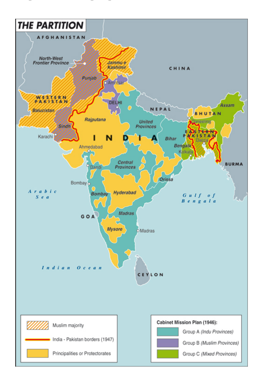
Map 1.2: India Map at partition, 1947