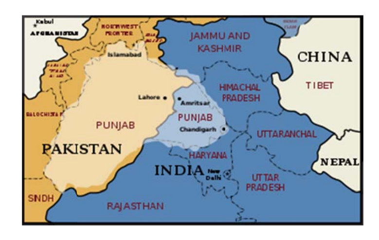
Map 4.2 Punjab