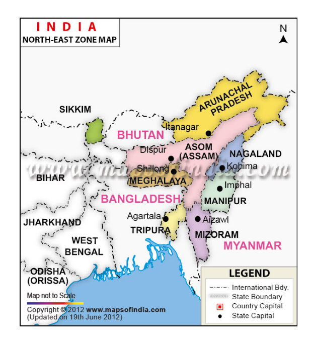
Map 4.4 Northeastern India