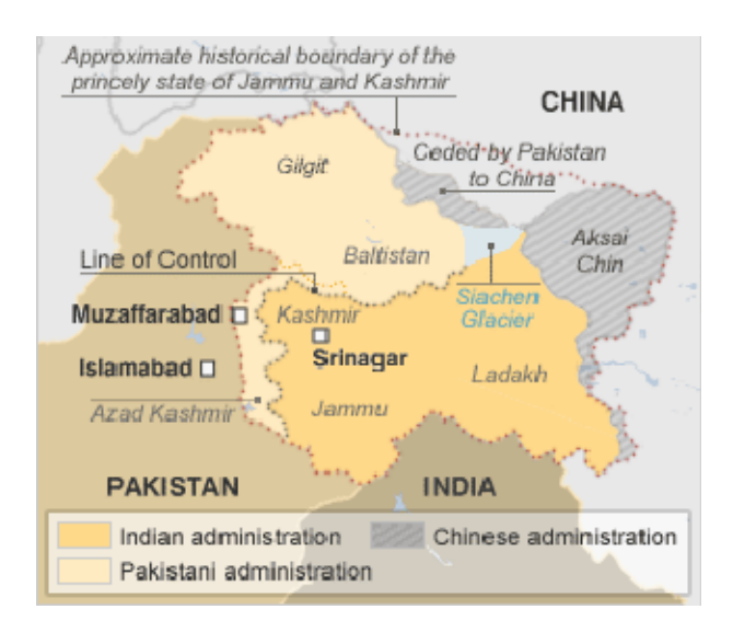
Map 4.3 Jammu and Kashmir