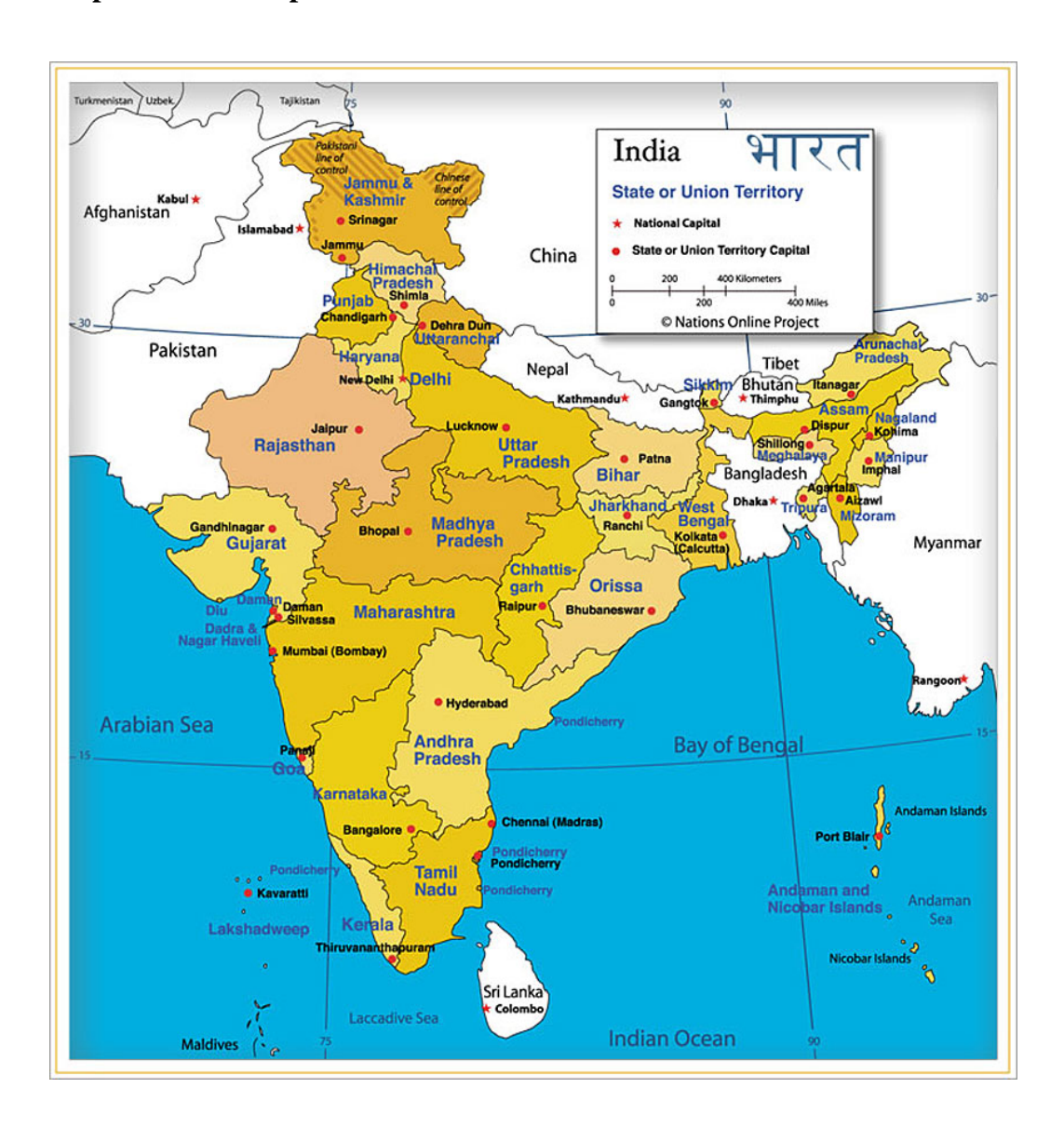
Map 1.3: India Map as of 2012