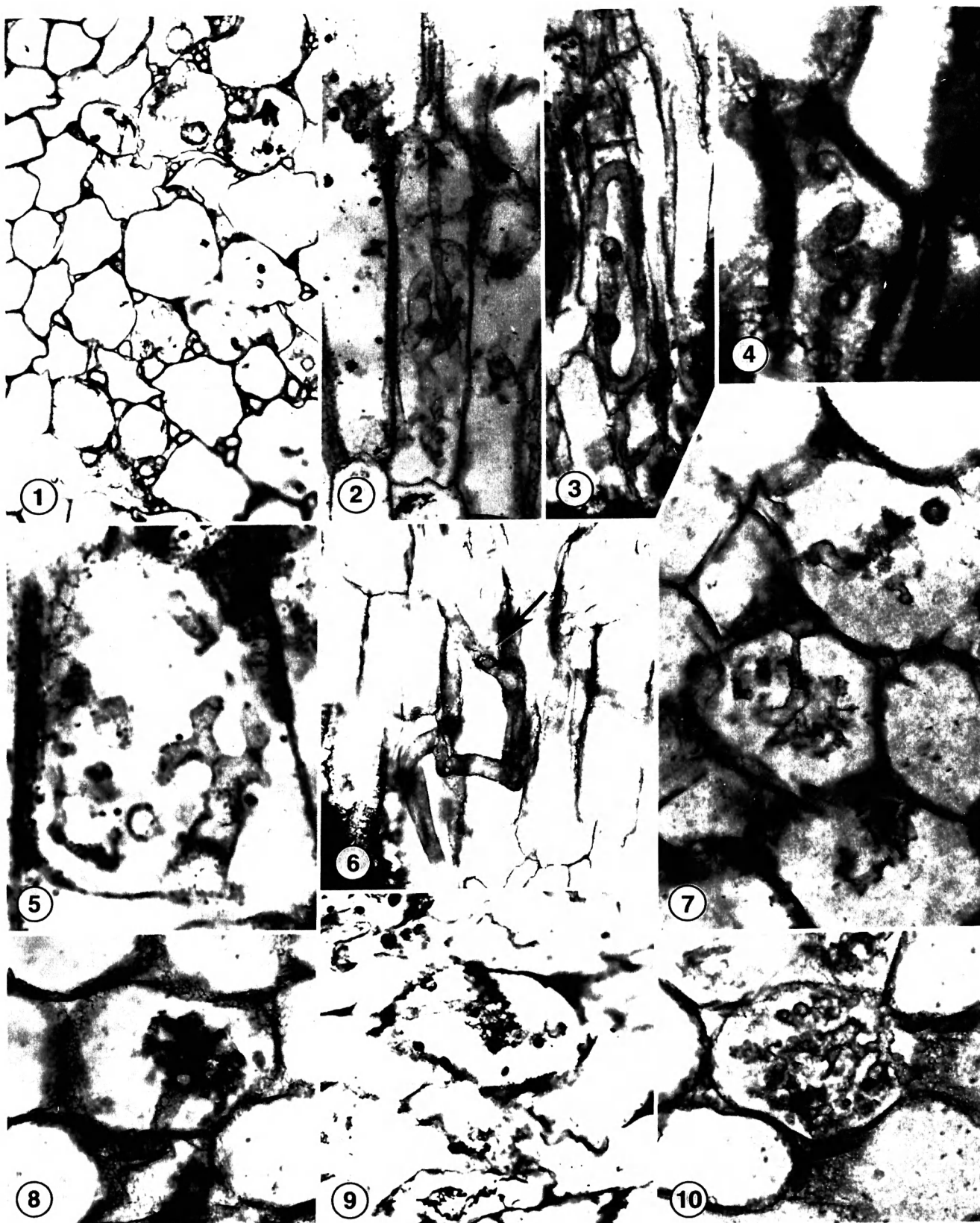
FIGS. 1-10. Gigasporites and Glomites mycorrhizae. 1. Cross section through root with intercellular and intracellular hyphae. Slide 16805, \times 400 . 2. Hyphae of Gi. myriamycetes . Note the uneven thickness. Slide 16805 \times 400 . 3. Gi. myriamycetes hypha with swelling. Slide 19748, \times 400 . 4. Hypha of Gi. myriamycetes , showing extensive coiling within the cell. Slide 19741, \times 880 . 5. Dichotomously branched hypha. Note septum at branching point. Slide 16805, \times 640 . 6. Hypha with discontinuous