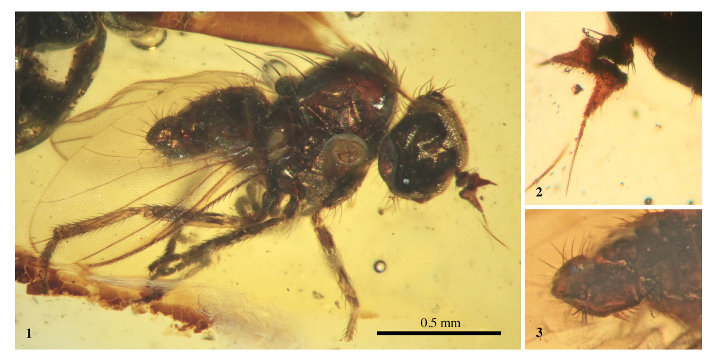
Figure G1. Microphorites magaliae n. sp., holotype male IGR.GAR-106a, in Late Cretaceous amber of Vendée, NW France. 1, habitus in right lateral view; 2, detail of antennae; 3, detail of the genitalia.

terminalia rotated forward beneath the preceding segments of the abdomen (Wiegmann, Mitter, & Thompson, 1993). Microphorinae and Parathalassiinae are distinguished from other dolichopodids by the presence of an additional basal crossvein (bm-cu) and crossvein dm-cu connected to the base of M<sub>2</sub>. Recent molecular analyses even suggest that Parathalassiinae are part of Dolichopodidae s.str. , with Microphorinae as sister group to the latter (Germann & others, 2011).