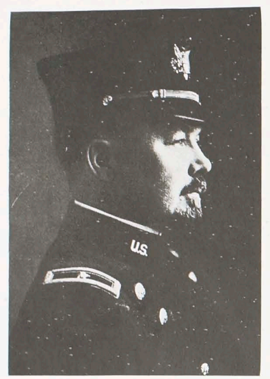
MAJOR-GEN'L FREDERICK FUNSTON

By JAMES NAISMITH Chaplain of First Kansas Infantry