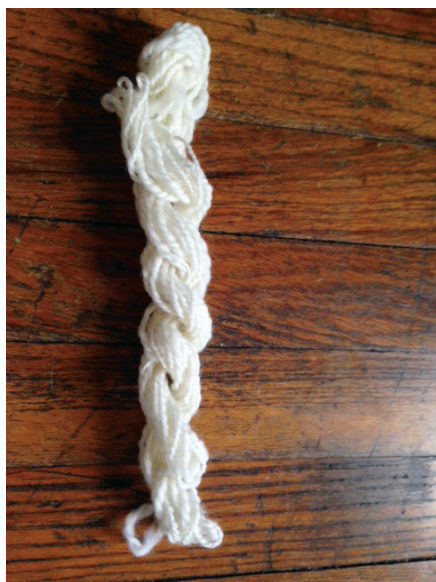
100% wool, 0% milkweed

Future researchers and/or artists should test the durability of textiles made with milkweed fluff to determine whether or not it could be suitable for large scale production. If it proves to be durable (throughout extended use and multiple wash cycles), then it could be grown in