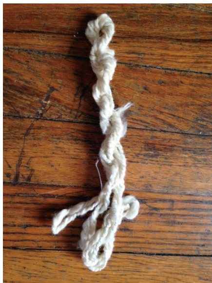
25% wool, 75% milkweed