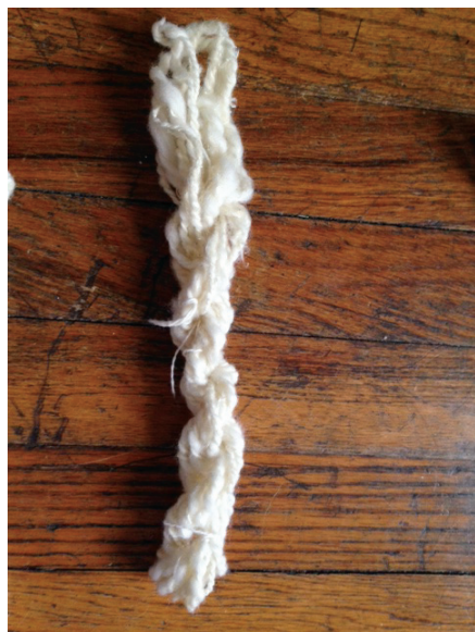
50% wool, 50% milkweed