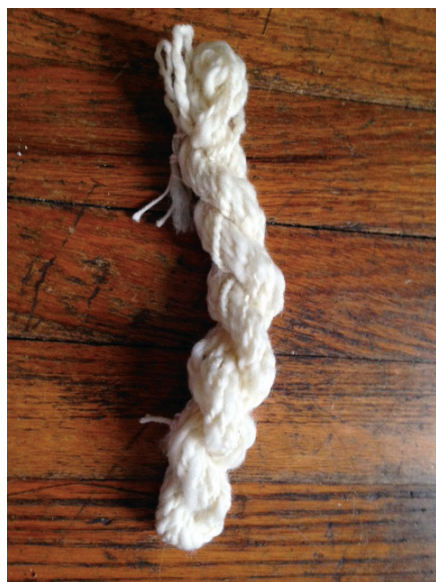
75% wool, 25% milkweed