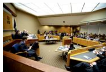
KU ON FLICKR